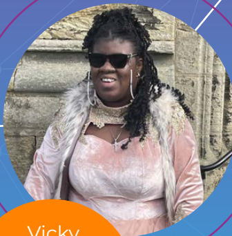
Vicky dressed to the 9s to celebrate Easter!