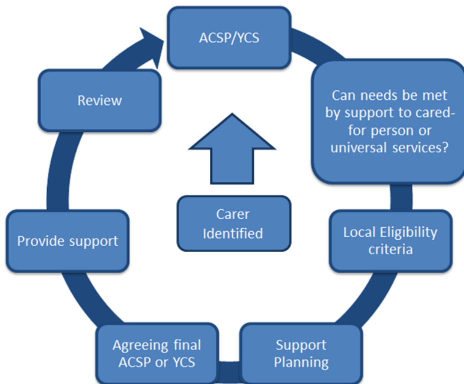
Figure 1: Carer Support Pathway

The Act establishes a process to determine whether a local authority has a duty to provide support to an individual carer to meet their identified needs, as illustrated by the Carer Support Pathway in Figure 1.