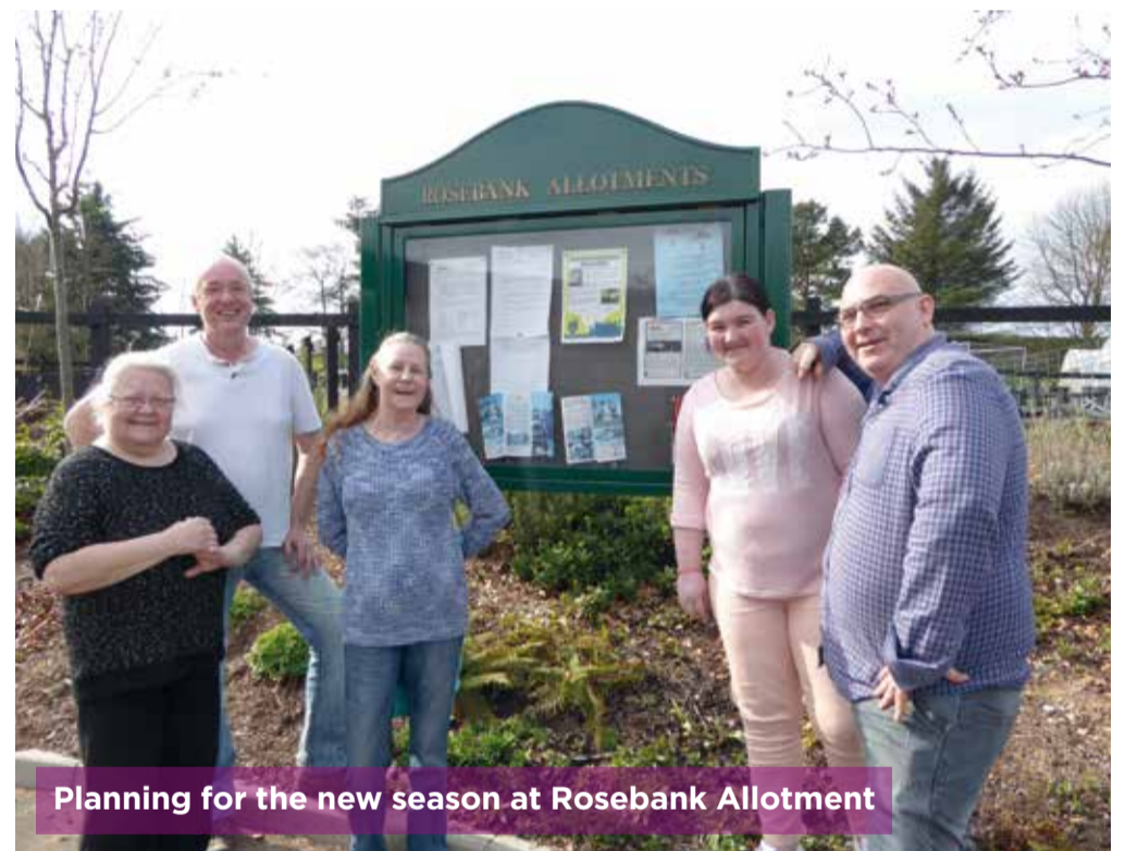
Planning for the new season at Rosebank Allotment

When we last reflected forward in this way – in 2015 – we set a “building strategy” to transform us into a “next generation social care provider”; we imagined