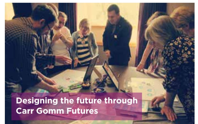
Designing the future through Carr Gomm Futures

So far, we have already seen some brilliant ideas coming through the online portal. Initiatives to date include staff having access to information about local community resources (a page has been set up on the Intranet called 'The List'), improving how we involve people who have limited communication in decisions about their support while finding out what matters to them, and using the 'Healthy Eating, Healthy Living' training pack when supporting people with learning disabilities to eat well. If