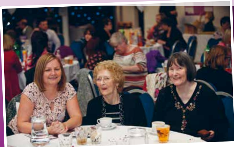
Enjoying each other's company and conversation