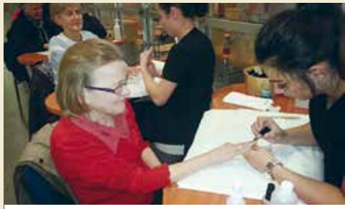
Enjoying a pamper day in Glasgow, thanks to Catch the Dream