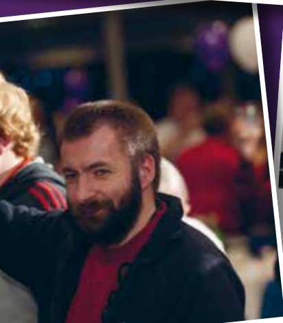
Gomm and our achievements