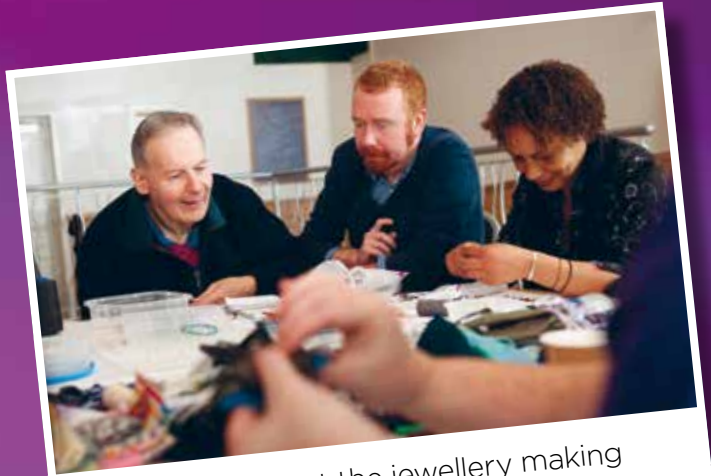
Getting creative at the jewellery making workshop