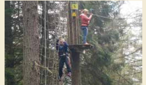
Unleashing their inner Tarzan! A group from Argyll & Bute spend the day at 'Go Ape'