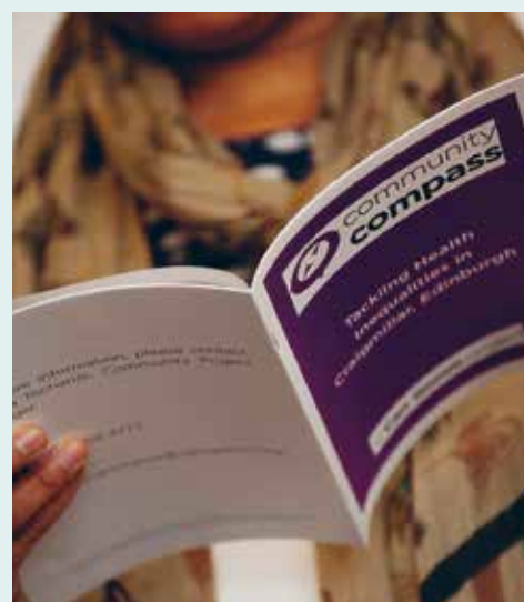
Celebrating a year of successes