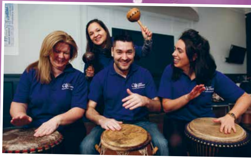
"This certainly beats a day in the office!" Carr Gomm staff enjoy the African drumming workshop

We hope that everyone enjoyed the day! It was great to see so many familiar and new faces coming together to celebrate our achievements over the last twelve months.