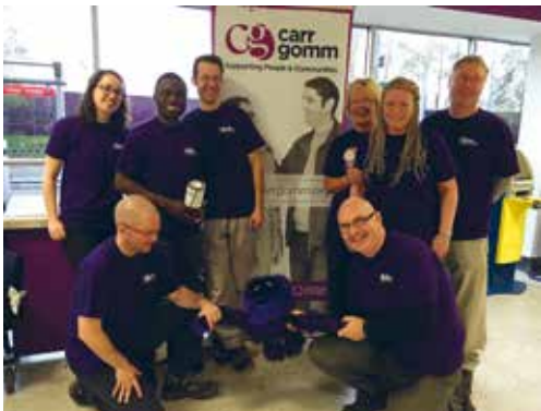
The Sahara trekkers with their furry friend Gizmo