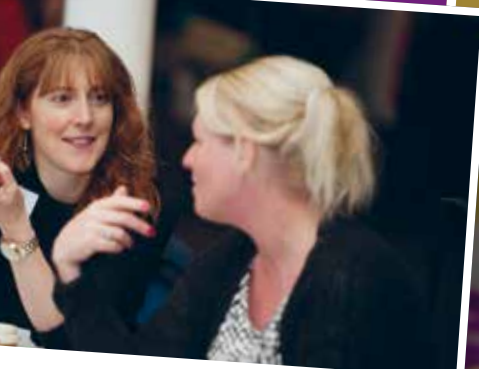
d Ella catch up over a coffee