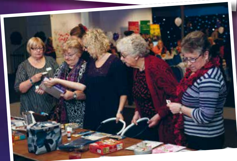
"What have I won?"