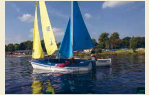
Smooth sailing at Clyde Muirshiel Park

We are currently developing our fundraising plans for the future. If you have any ideas or would like to get involved, please contact the Fundraising Team on 0131 659 4790 or email fundraising@carrgomm.org