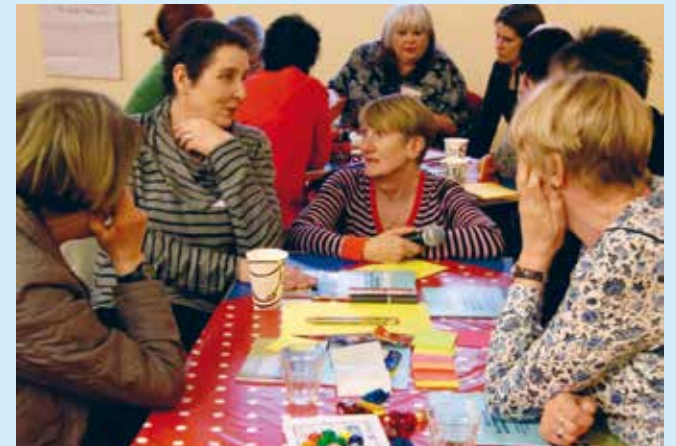
Working together to navigate Self-Directed Support

If you want to find out more about SDS or are unsure about how it could affect you, please speak to your Key Worker or contact us on 0300 666 3030.