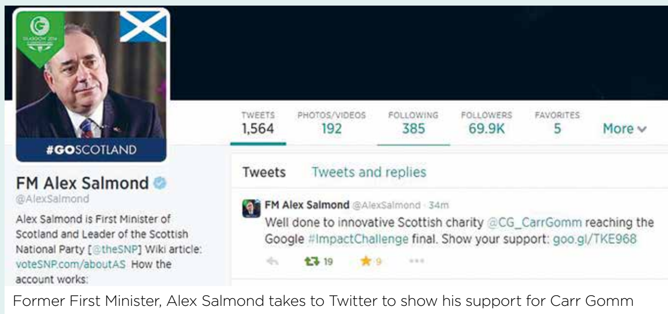
Former First Minister, Alex Salmond takes to Twitter to show his support for Carr Gomm

It is often said that when opportunity comes knocking, you should seize it. This summer, we did just that. We entered Click Go, our online tool to help people have more choice and control over their support, into a major UK wide competition run by Google. Little did we know just what would lie in store after the application was submitted.