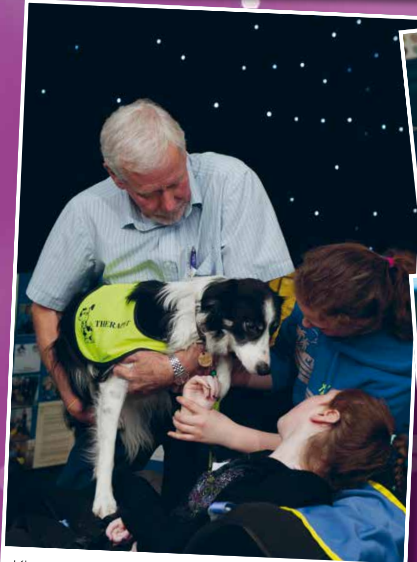
Kiera, a Therapist therapy dog, enjoying the attention