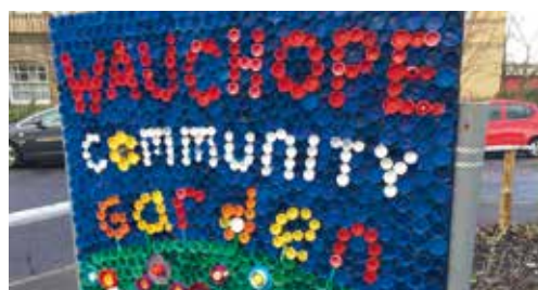
A warm welcome meets you at the garden