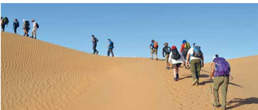
The group crossed varied terrain including a lot of sand dunes

“It was thirty degrees in the shade and there was no shade!”