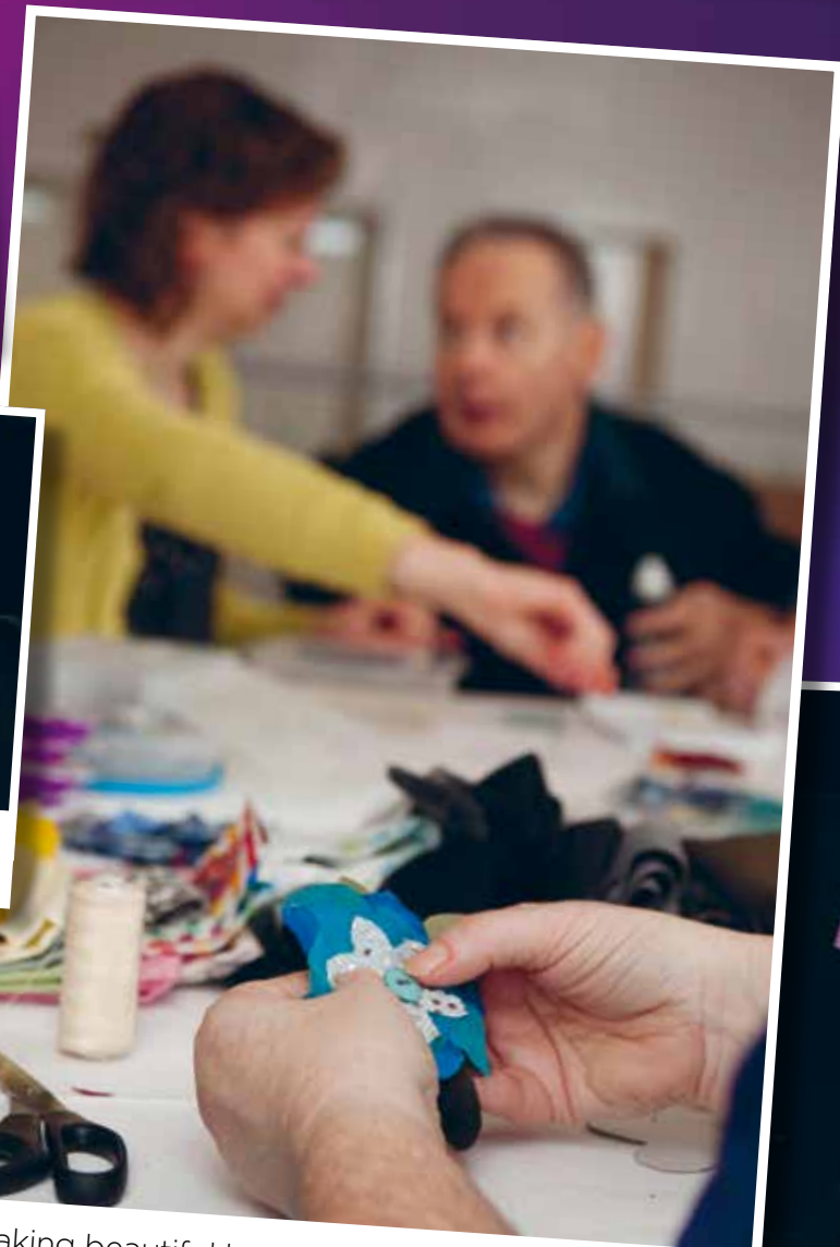
Making beautiful brooches at the jewellery making stall