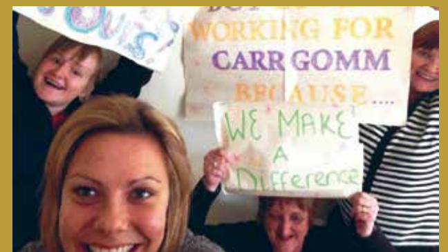
Our Broomage team share why they love working for us

All successful candidates are subject to a Protection of Vulnerable Groups (PVG) check.