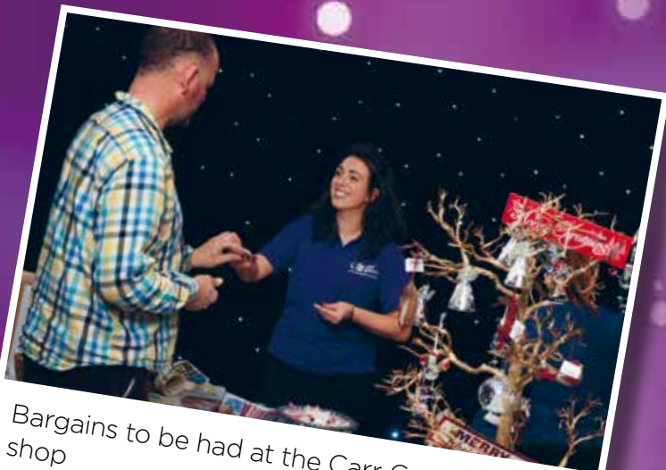
Bargains to be had at the Carr Gomm pop up shop