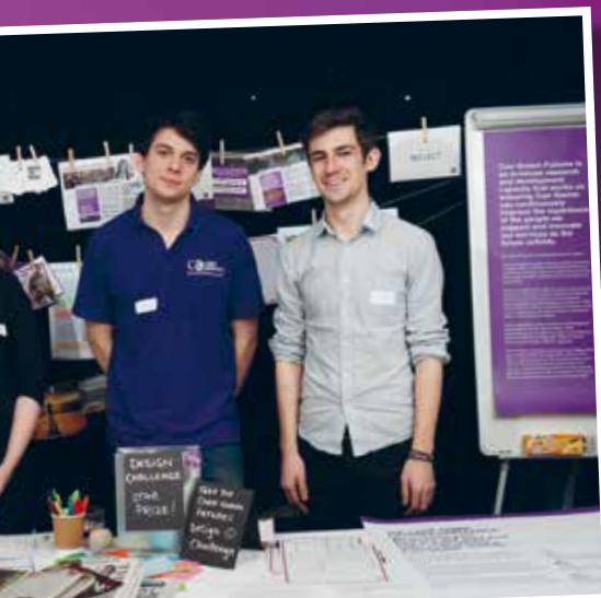
, all in a day's work at the Carr Gomm