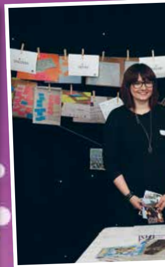
Designing the future Futures stall