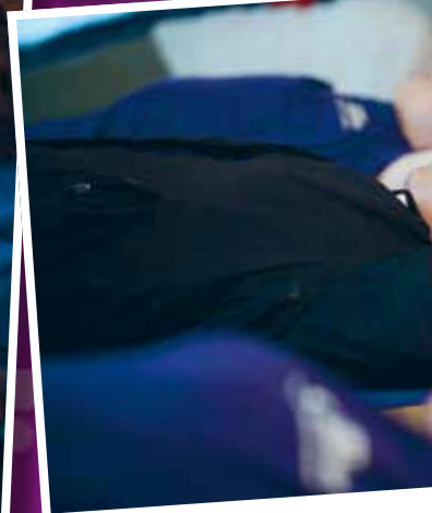
Relaxing in the Yoga v