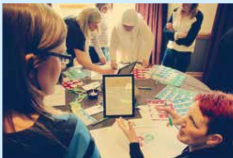
Working together to design the future

We live in fast-changing times so it’s really important that we are able to respond quickly and effectively to new challenges and opportunities as they arise. Carr Gomm Futures will help us to do this, by bringing together people from across the organisation to develop and implement new ideas.