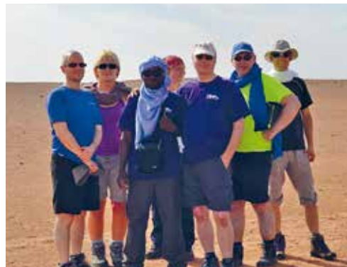
Ready, steady go! The group at the starting point