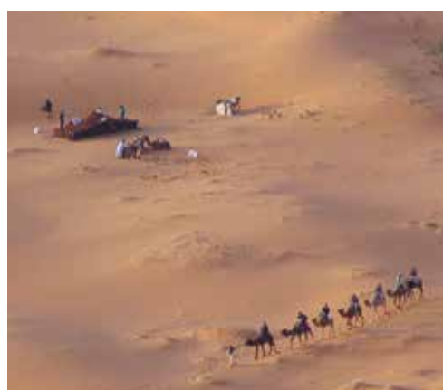
Camp at last!