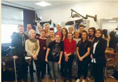
Looking good! All smiles at the Glasgow pamper day

In the last couple of years, fundraising has become a regular feature within the newspaper. From trekking the Sahara to running marathons and holding bake sales, our supporters have thought of interesting and unusual ways to raise money for us.